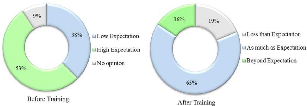
Figure 1: Expectation regarding the Training Course